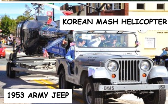
KOREAN MASH HELICOPTER