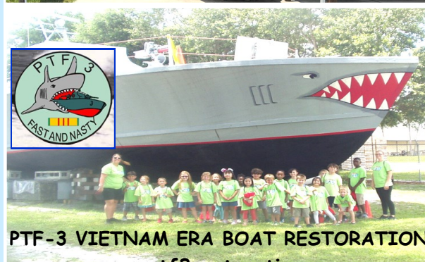
PTF-3 VIETNAM ERA BOAT RESTORATION