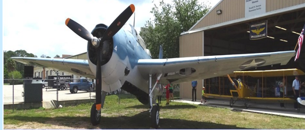
Grumman TBF Avenger Restoration Project